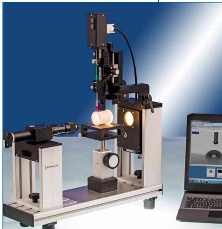
OCA 15EC Package 1MAX incl. SD-DM, ESr-N, dpiMAX20P