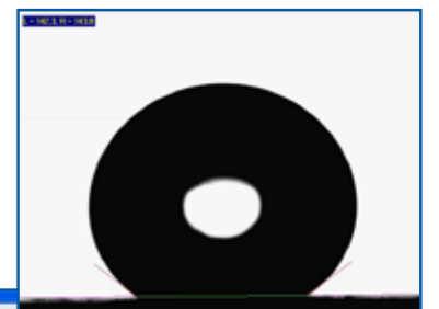
Water drop on an ultrahydrophobic substrate