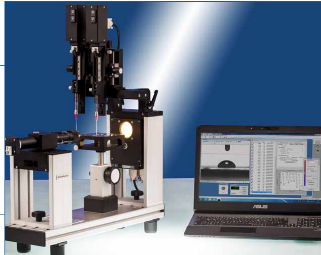
OCA 15EC Package 2MAX incl. DD-DM/EC, two ESr-N, dpiMAX20P and dpiMAX 21P

The OCA 15EC Package 2MAX consist of a double direct dosing system DD-DM/EC, two electronic dosing units ESr-N, and the software modules dpiMAX20P and dpiMAX 21P. The OCA 15EC can be easily broken down for transportation in the optional case TBO.