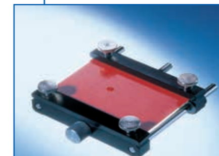
Film sample holder FSC 80

sive contributions, based on the analysis of the drop shape of pendant drops